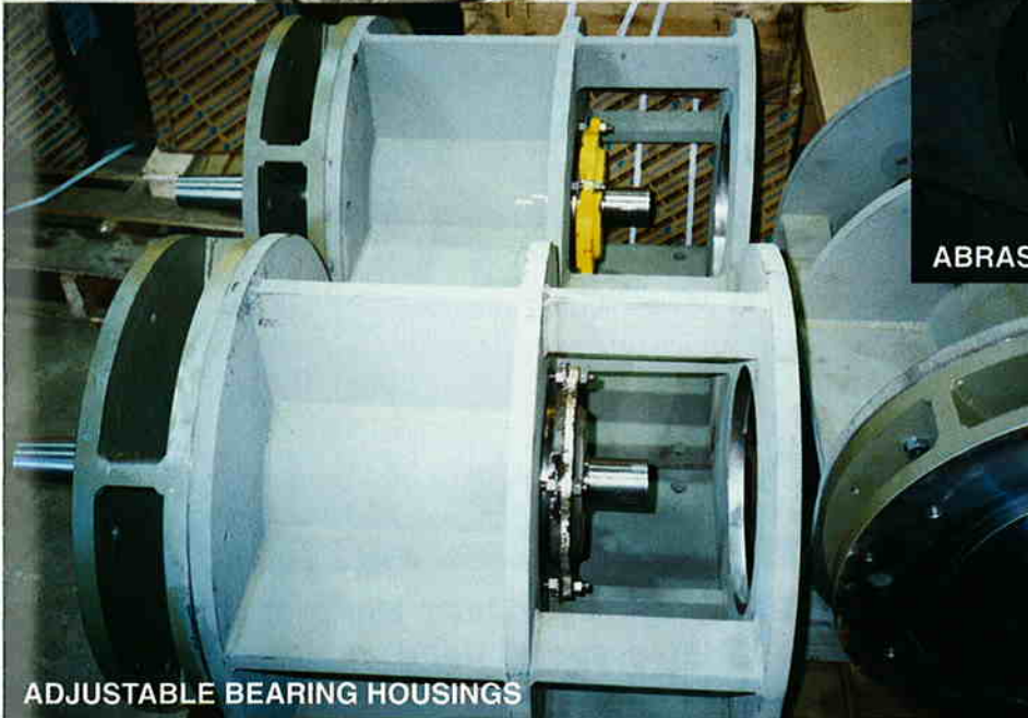
ADJUSTABLE BEARING HOUSINGS