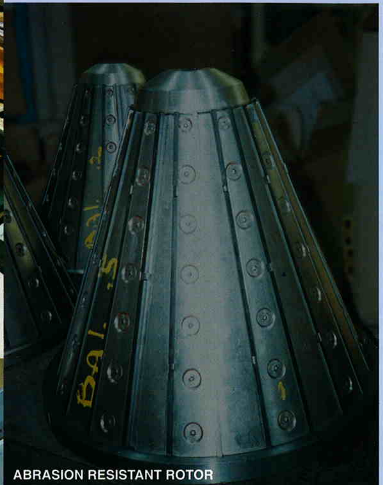
ABRASION RESISTANT ROTOR