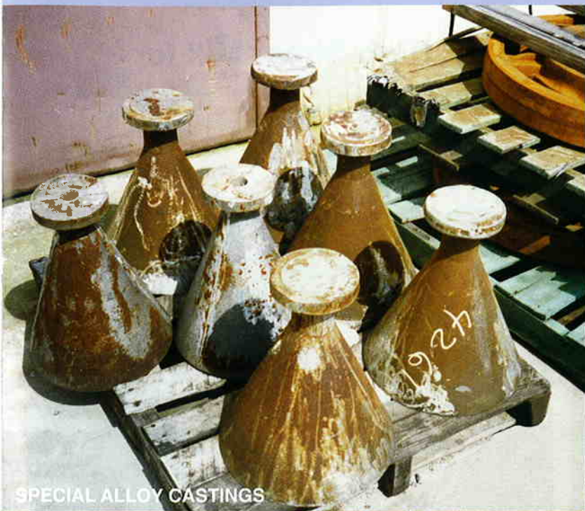
SPECIAL ALLOY CASTINGS