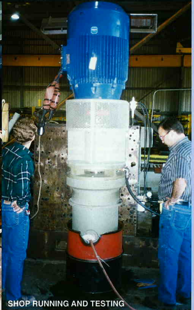
SHOP RUNNING AND TESTING